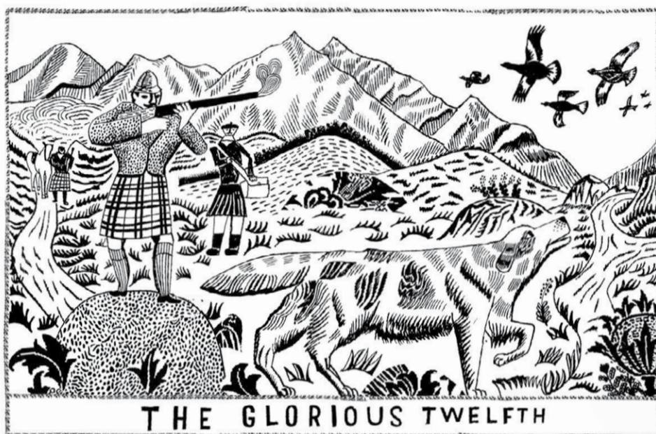
THE GLORIOUS TWELFTH